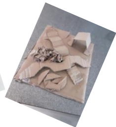
Art inspired by Louise Nevelson and investigating light.